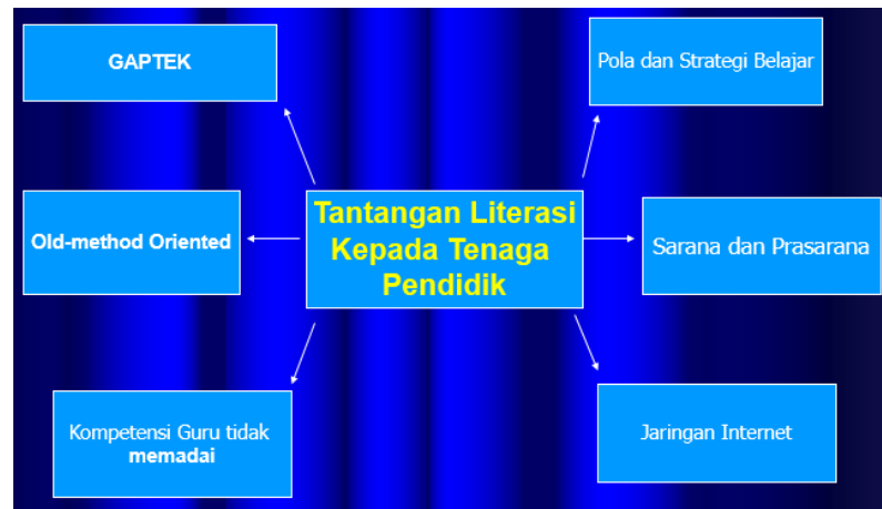
Image 6. Digital Literacy Challenges for Teachers in PowerPoint Slide Presentation

Apart from the positive impacts and challenges for educators and students, the researchers discovered that there are also challenges for parents in the digital era, including easier internet access, the freedom to connect without rules, a lack of understanding of internet risks, parents who are unsure what to do, and parents who stutter with digital technology. Parents can assist their children in the digital world by activating Google Safe Search, which filters out explicit search results such as pornography and violence, by activating restricted mode on YouTube, by using YouTube Kids, by understanding age ratings, and by activating parental controls. on the Google Play Store