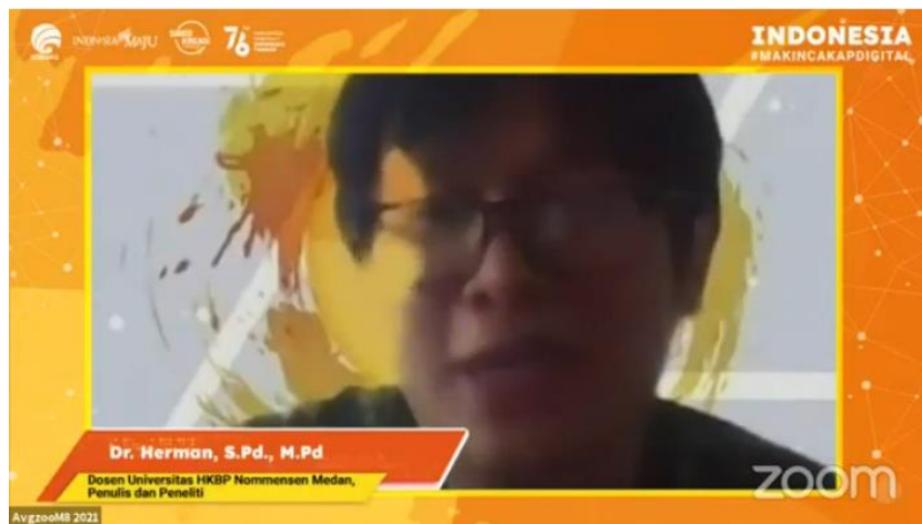
Image 3. Presenter responded questions from participants