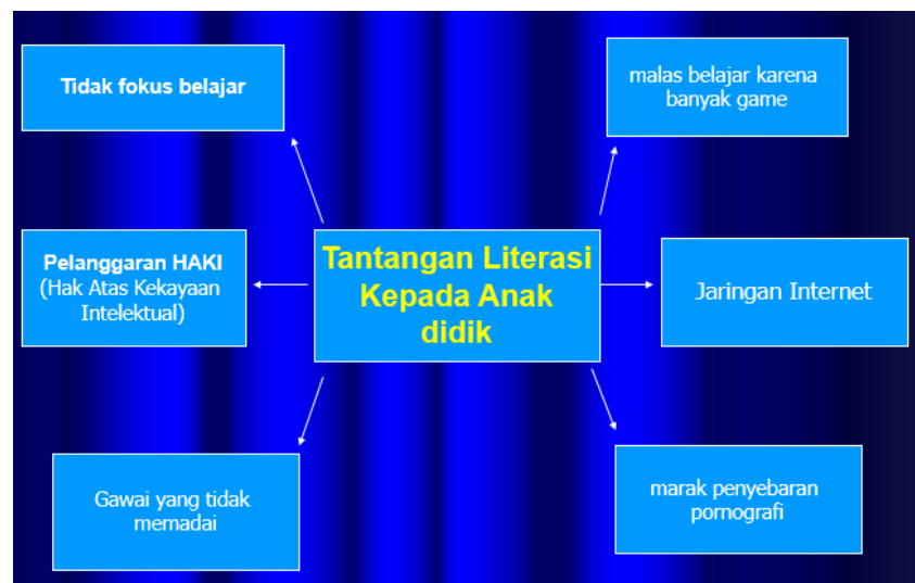
Image 5. Digital Literacy Challenges for Students in PowerPoint Slide Presentation