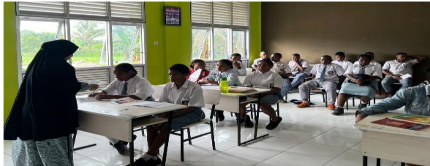
Figure 3. Situation moment activity giving education

students submit question to instructor. Then instructor answer question from the students the. After get answer the question is, the students ask looks Already understand. Extension materials form education about HIV/AIDS with using leaflets and videos. Participants counseling is also available gift enough as well as leaflets and videos about HIV/AIDS for teachers at schools the.