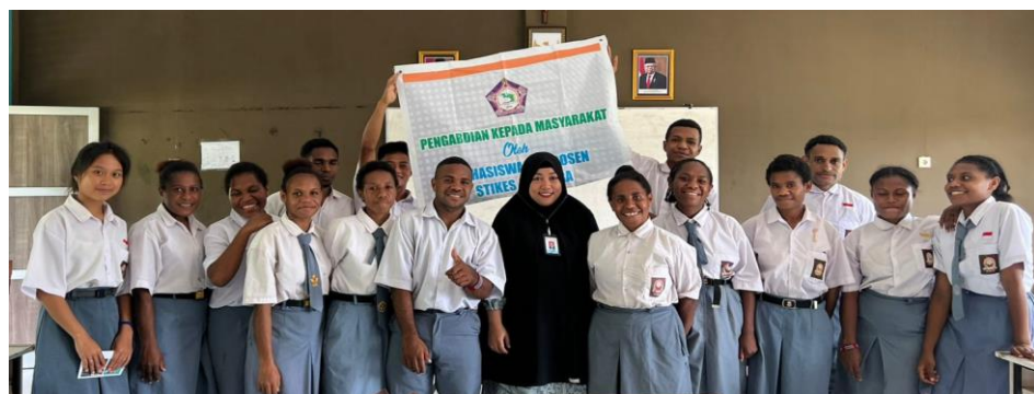
Figure 5. Documentation final after activity