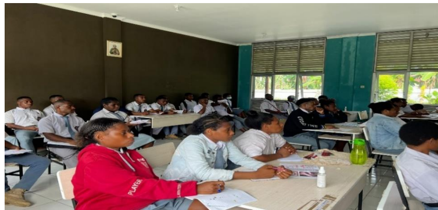
Figure 4. Situation moment student schoolgirl listen/pay attention education provided