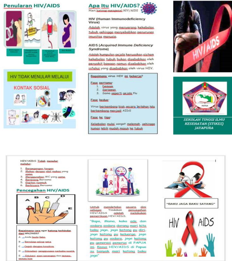
Figure 2. HIV/AIDS Leaflet Front Back of HIV/AIDS leaflet