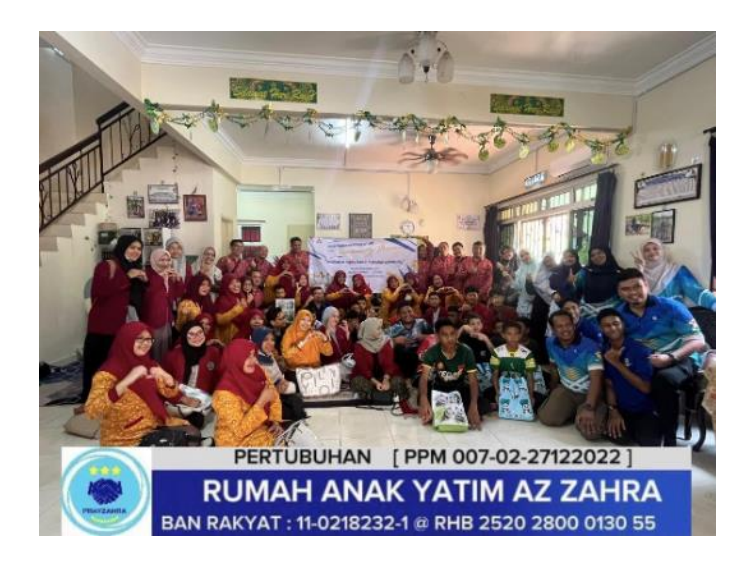
Figure 3. Evaluation and Documentation

The figure 3. evaluates knowledge about yoga exercises, evaluates community service during activities and documents community service activities.