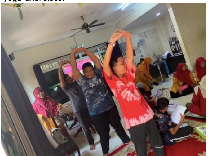
Figure 2. Yoga activity

The figure 3. evaluates knowledge about yoga exercises, evaluates community service during activities and documents community service activities.