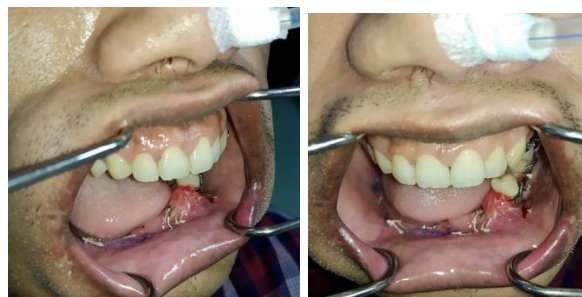
Figure 6. Post-operative day VII

infection, the affecting was performed alternately, and centric occlusion was checked.