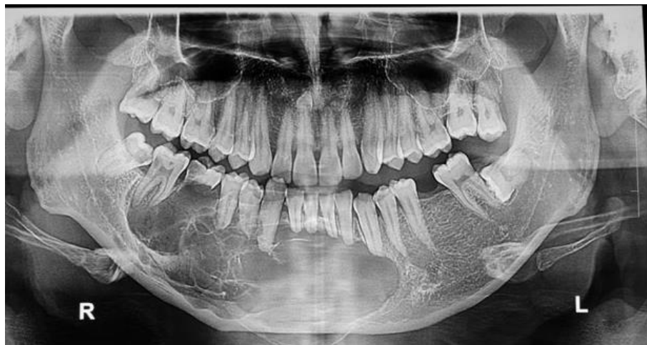
Figure 3. Panoramic radiograph.

appearance with ill-defined periphery extending from 34 to 47 region to the inferior border of the mandible.