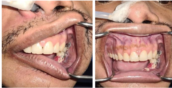
Figure 7. Post-operative day XXI