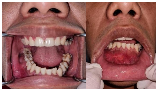
Figure 2. Intraoral examination.

Panoramic radiograph (Figures 3) was performed and it showed a defect along the right mandibular, a bubble soap with mixed radiolucent and radio-opaque