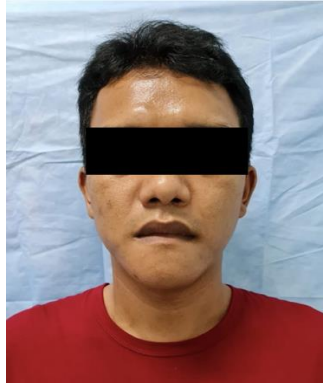
Figure 1. Patient profile condition